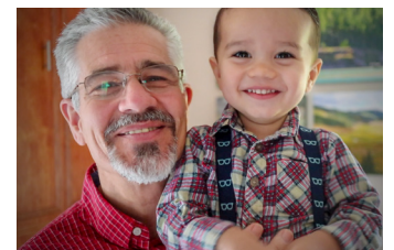
Me with one of my grandsons